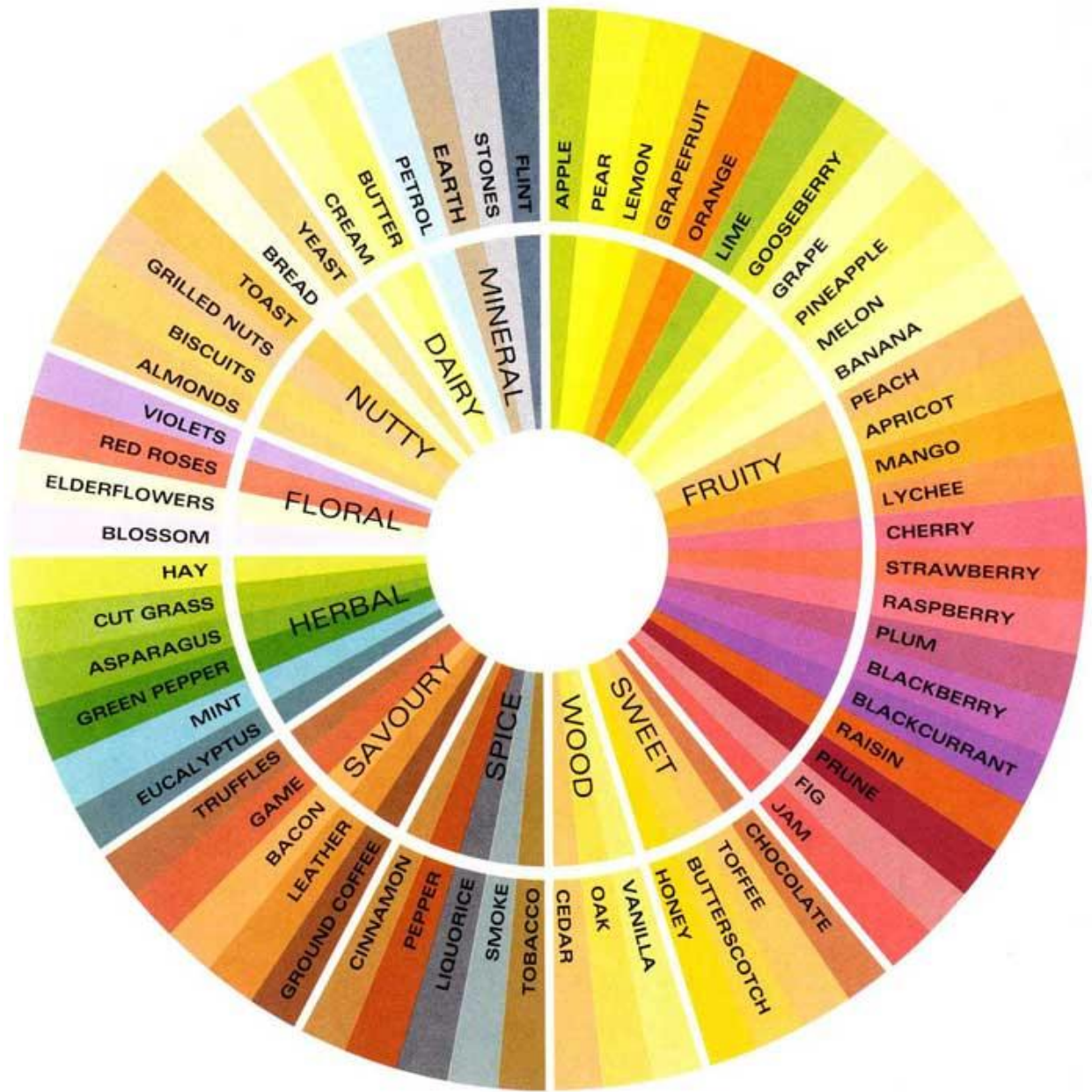
Wine Flavor Wheel (Not widely adopted)