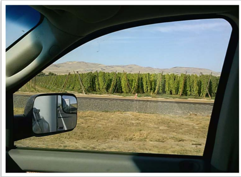
Hop Field in Moxee, WA